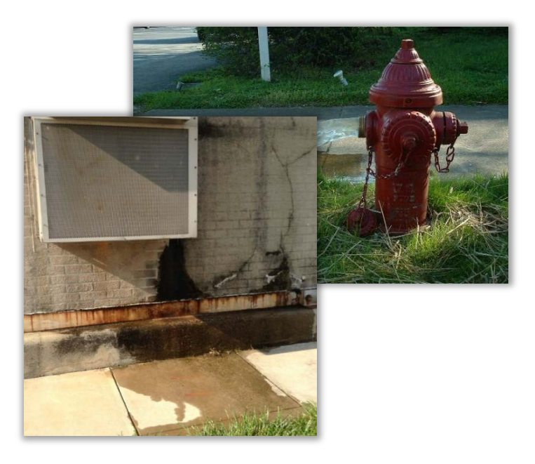
Table 2. Discharges not typically considered as illicit discharges.

There are some discharges not considered as illicit discharges unless TNCC identifies them as a significant contributor of pollutants. Allowable discharges, as listed in Table 2 , may not be easily identified as the source of a flow within the storm sewer. These flows can occur during dry weather, indicating a potential illicit discharge and resulting in an investigation to determine the source may be necessary. If the source is unknown it should be reported to the Buildings and Grounds Supervisor. Procedures for investigating the source of an illicit discharge are further described in Section 2.5 of this Handbook.