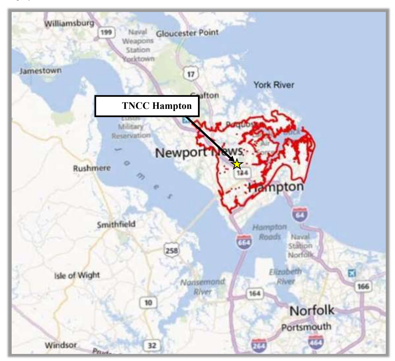
Figure 1. Location map of the impaired Back River Watershed (from Figure 1.1 of TMDL Report with TNCC location added).

primary contact recreation (e.g., swimming and boating) nor as a shellfish growing area due to highly elevated bacteria concentration.